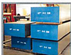
12"thick D-2 ESR blocks