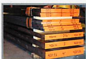
420SS ESR plates