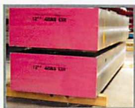
12"thick 420SS ESR blocks