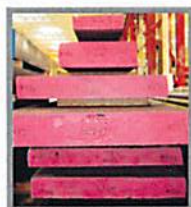
4140 HT plates