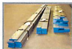
D-2 flats cut from plate

1-800-359-5959 440-951-7600 Fax 440-951-4877